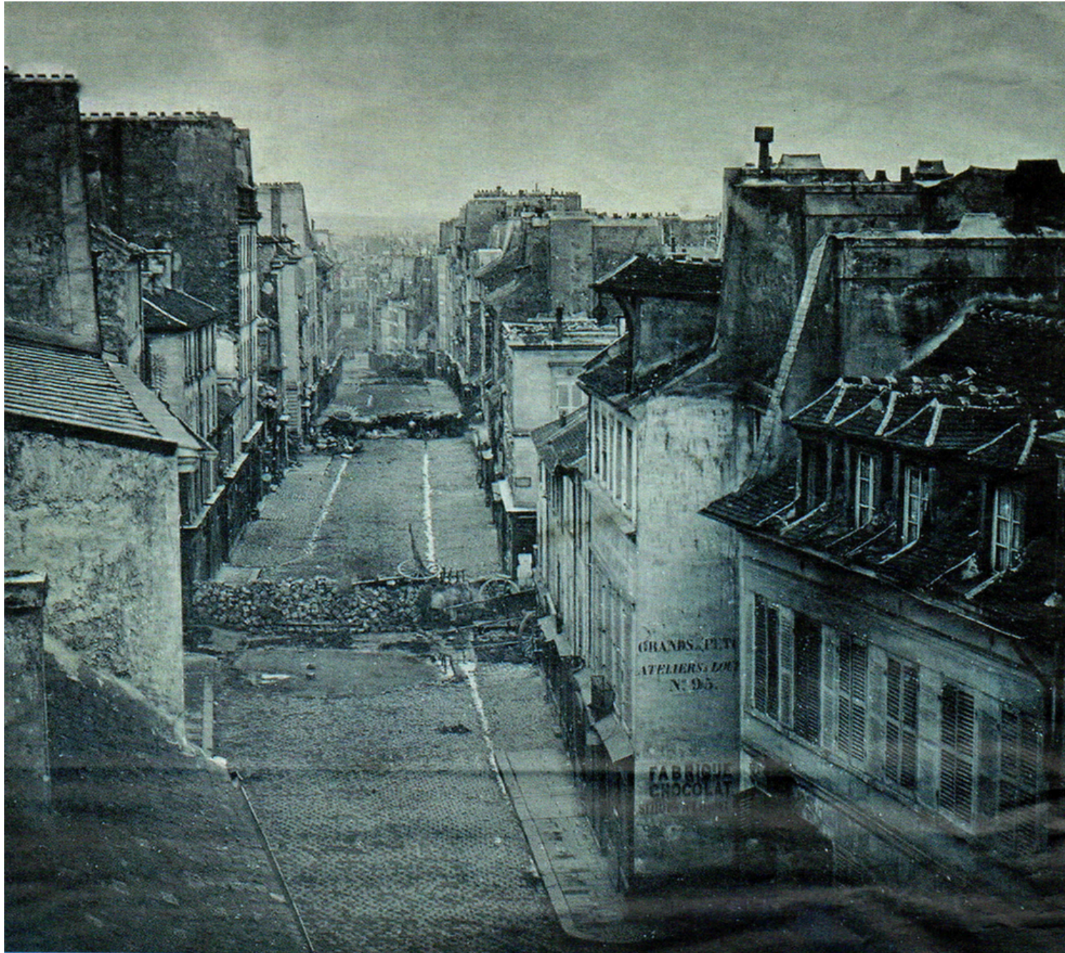
Rue du Faubourg du Temple June 1848: 3 barricades