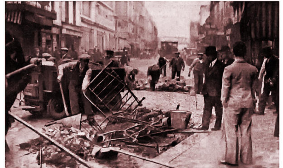
Sur la rue Nationale, la bagarre a passé