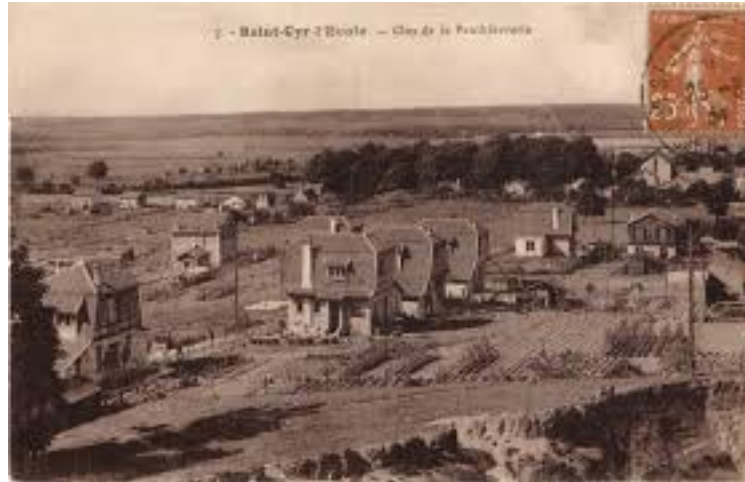
HBM "Art déco" on destroyed fortifications