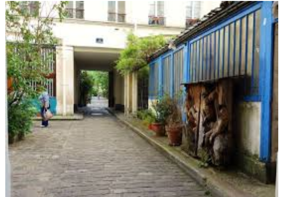
Working-class courée with work-shop (today)