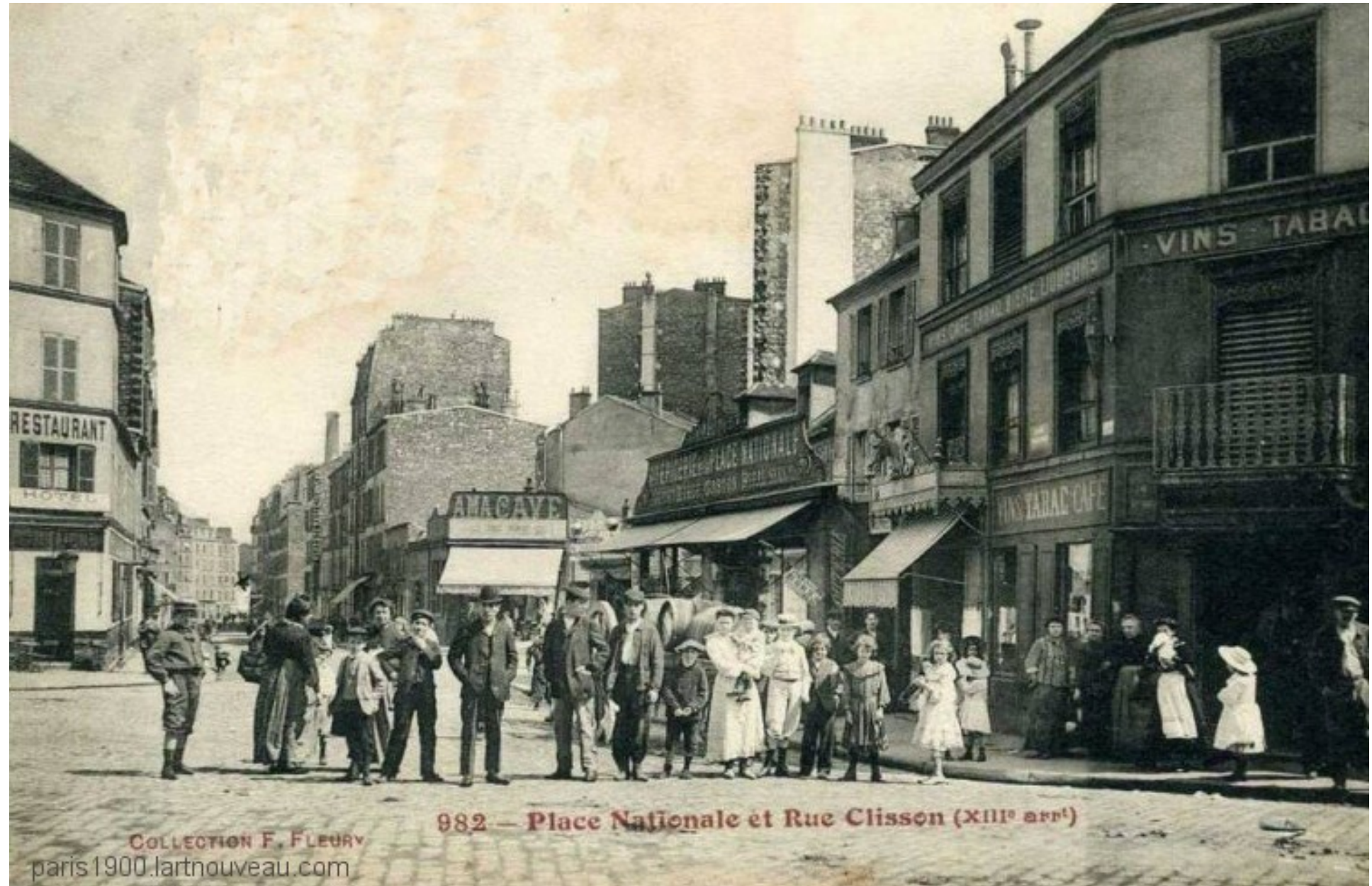
982 - Place Nationale et Rue Clisson (XIII e arr t )