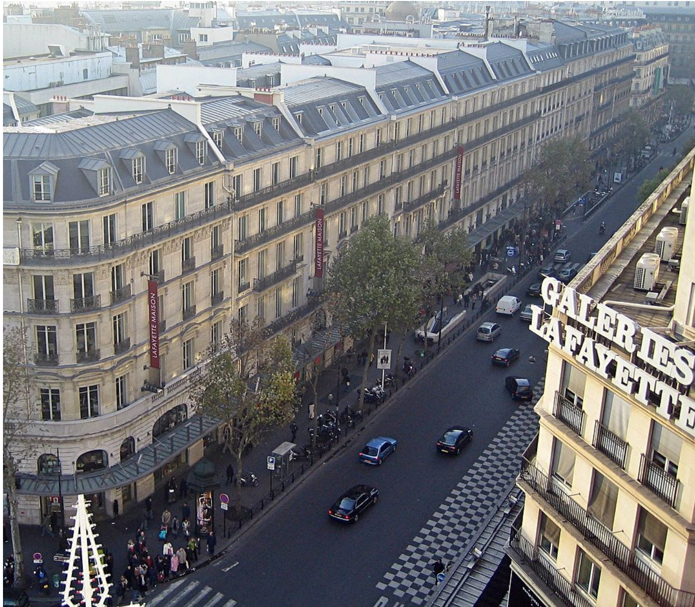
Boulevard Haussmann, today