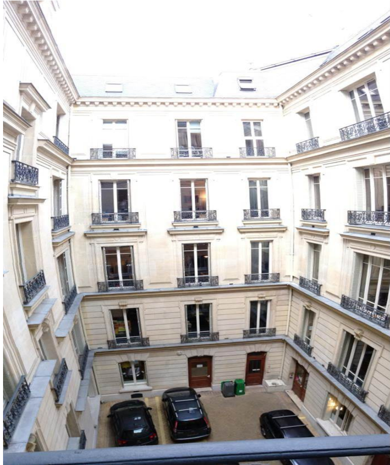
Bourgeois courée (today)