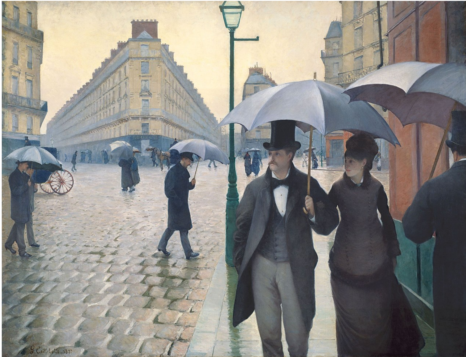
Jour de pluie in Paris, G. Caillebotte